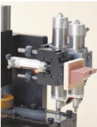
■ 90° Rotating Print Head