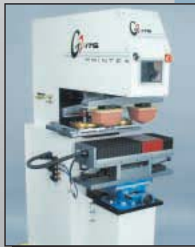
2 Color w/Pneumatic Slide