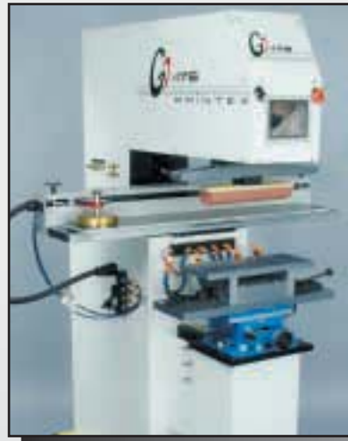
1-Color Transverse Cup