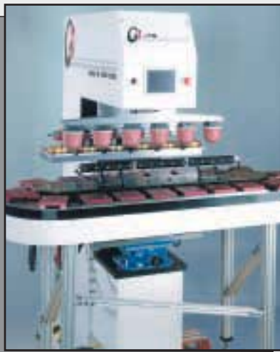
6 color w/Carousel Indexer