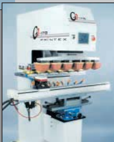
6 color w/Linear Servo Indexer