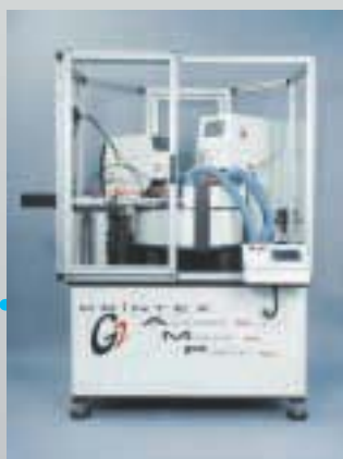
G2-100/115 and G2-60/85 installed on the G2-AMP