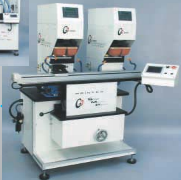
Two G2-100/115's installed on the G2-SMP