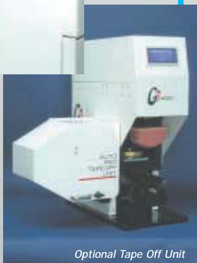
Optional Tape Off Unit