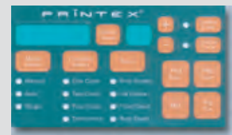
Membrane Switch Control Panel

The “M” stands for the same machine equipped with Fixed Logic CPU circuitry (instead of a programmable controller) and a Membrane Switch Control Panel (instead of touch screen panel). The Boss-125M machine retains much of the capabilities of the Boss-125 but costs about 20% less.